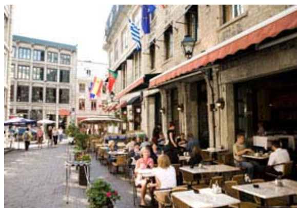
The cobblestone paths of Old Montreal.

Anchored by its central mountain (Mont Royal), Canada's island city is a harmonious dichotomy of English and French, past and future. Dotted with church steeples and wrought-iron balconies, the colourful landscape is home to one of the hottest arts scenes in the country, with international events like the Jazz Festival and Just for Laughs and homegrown phenomena like Cirque du Soleil. Add to this a liberal-thinking, multicultural society with a longstanding passion for terroir and a penchant for avant-garde fashion, and you have a city worth celebrating.