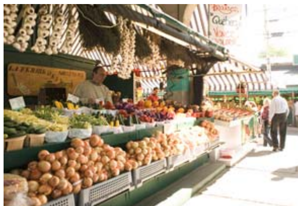
Farm-fresh picks at the Marché Jean Talon.