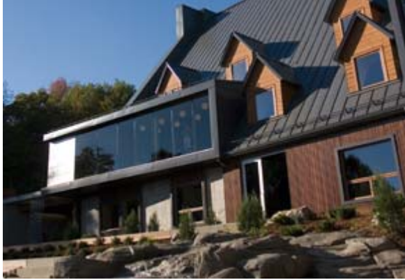
The Balnea spa in the Eastern Townships.