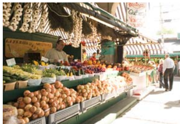
Farm-fresh picks at the Marché Jean Talon.