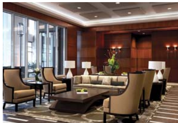
The lobby of Le Westin Montréal.