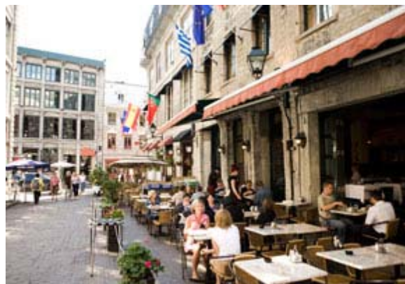
The cobblestone paths of Old Montreal.

Anchored by its central mountain (Mont Royal), Canada's island city is a harmonious dichotomy of English and French, past and future. Dotted with church steeples and wrought-iron balconies, the colourful landscape is home to one of the hottest arts scenes in the country, with international events like the Jazz Festival and Just for Laughs and homegrown phenomena like Cirque du Soleil. Add to this a liberal-thinking, multicultural society with a longstanding passion for terroir and a penchant for avant-garde fashion, and you have a city worth celebrating.